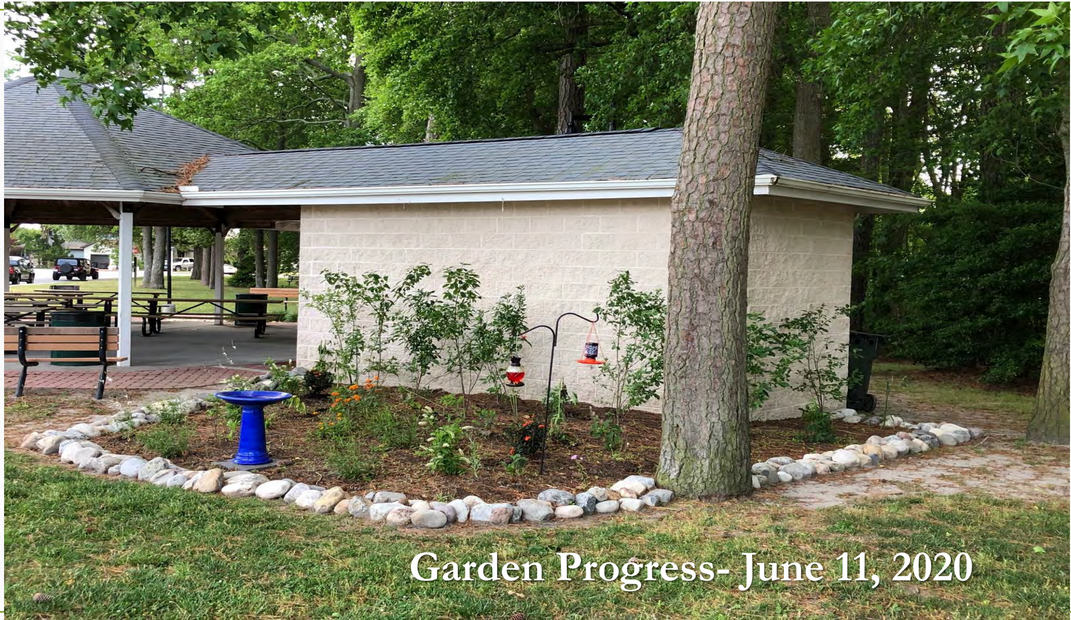
Garden Progress- June 11, 2020