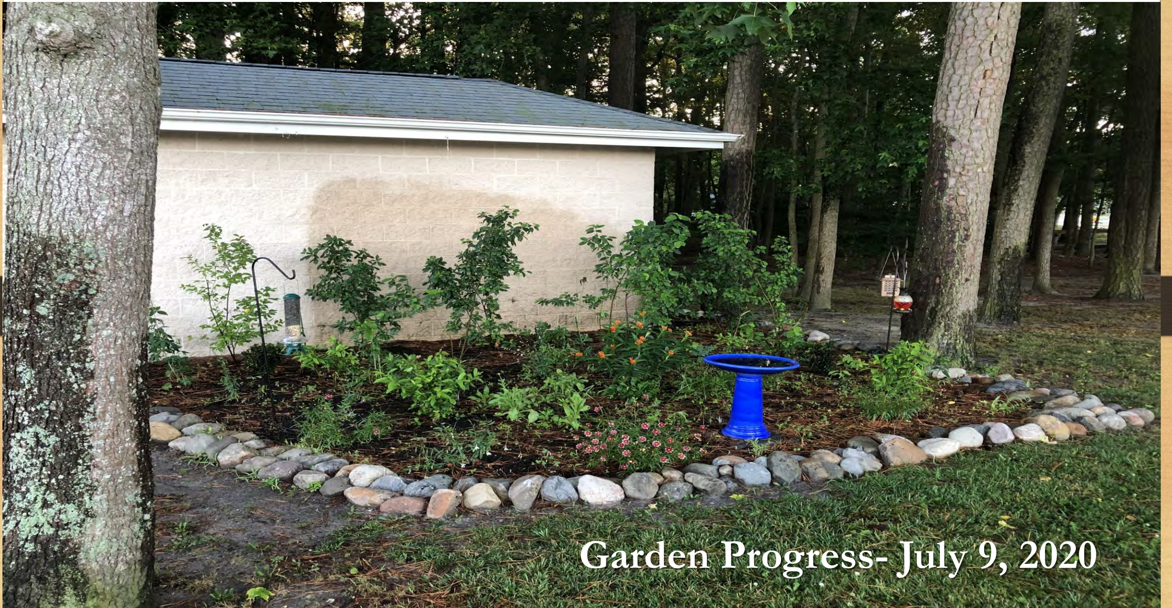
Garden Progress- July 9, 2020