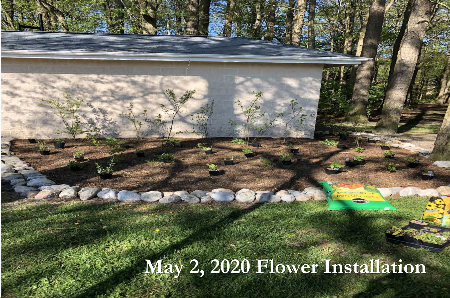
May 2, 2020 Flower Installation