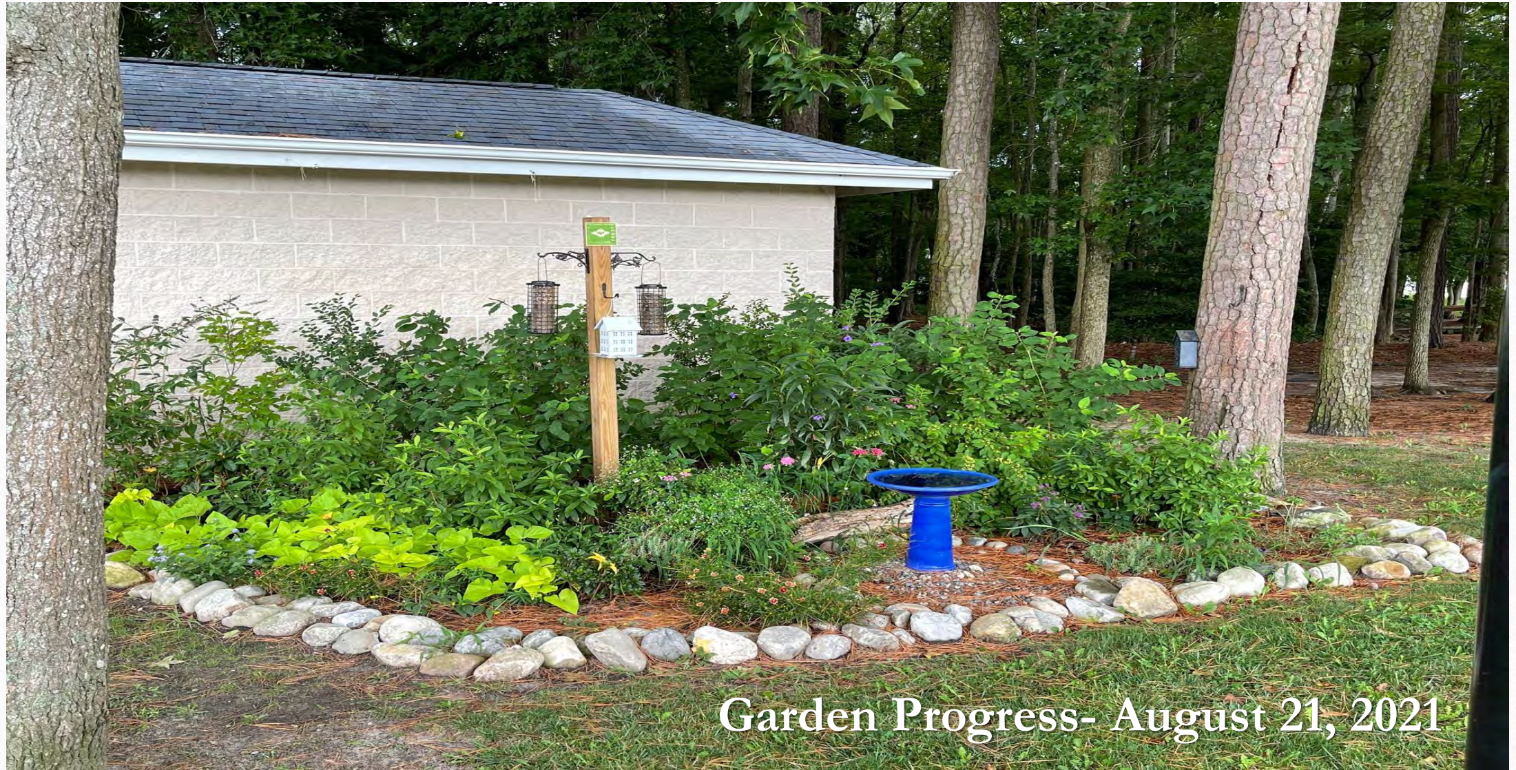
Garden Progress- August 21, 2021