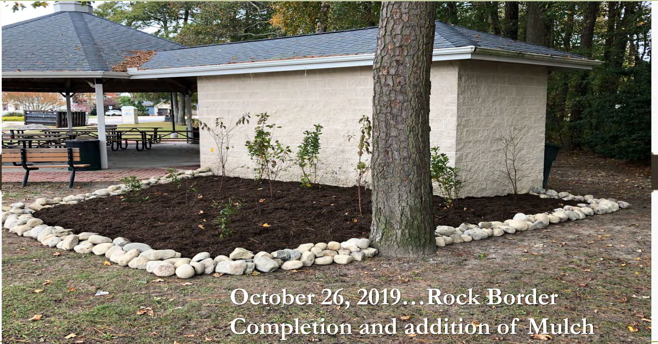
October 26, 2019...Rock Border Completion and addition of Mulch