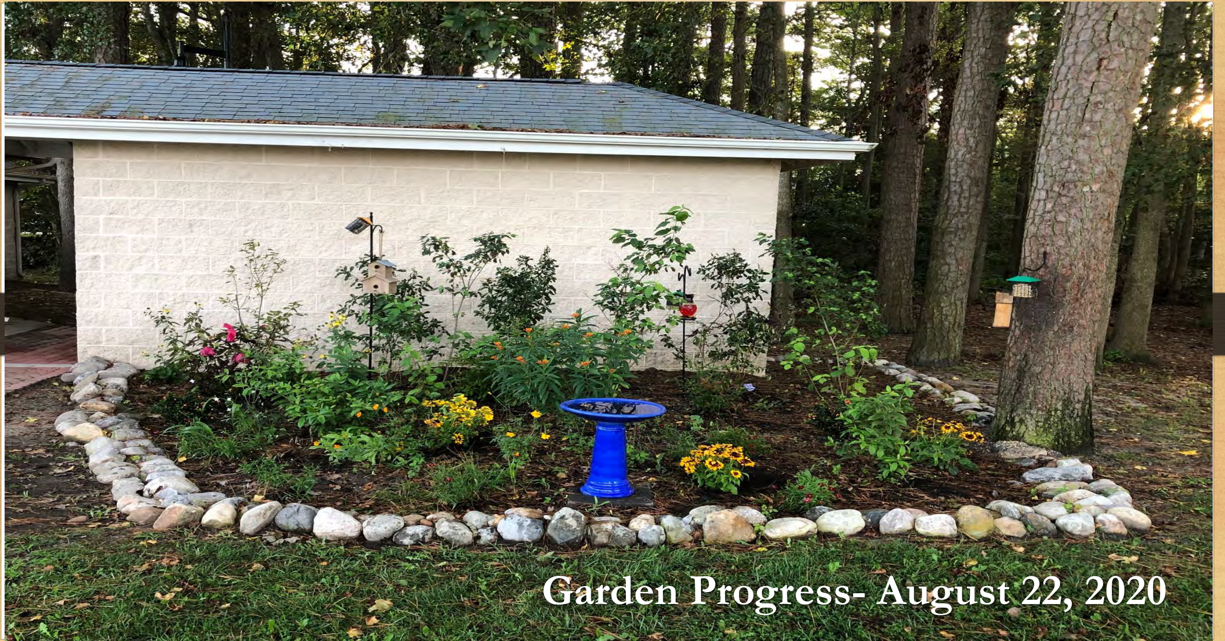
Garden Progress- August 22, 2020