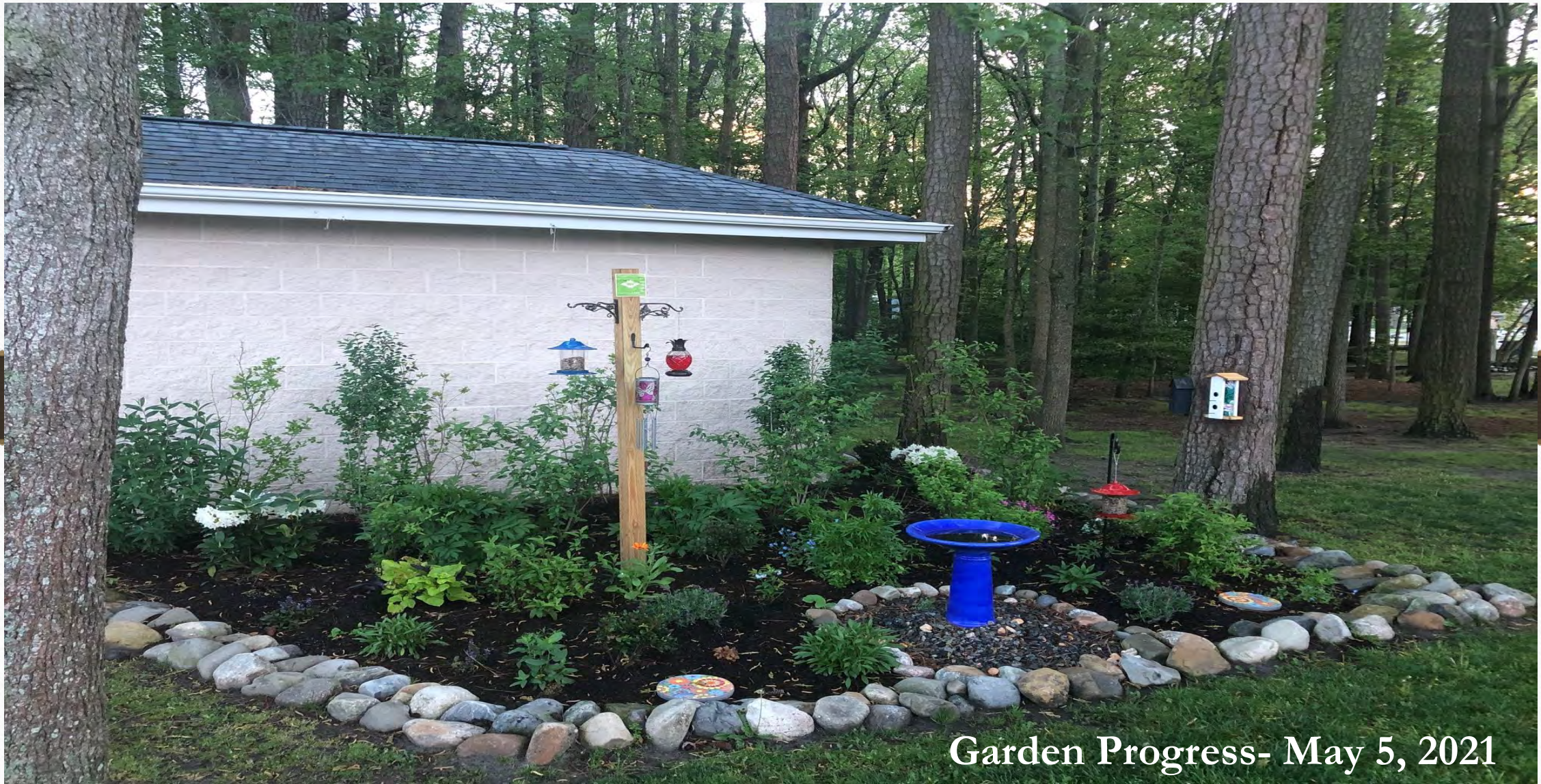
Garden Progress- May 5, 2021