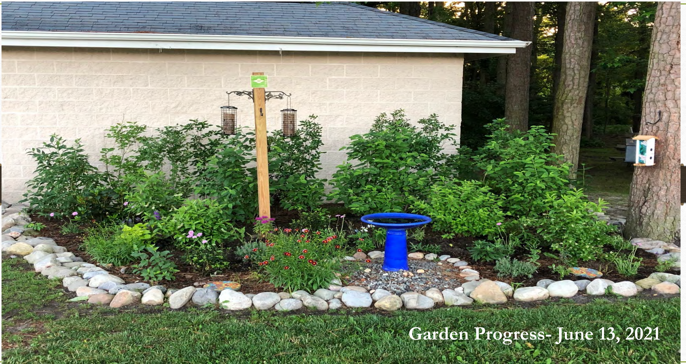
Garden Progress- June 13, 2021